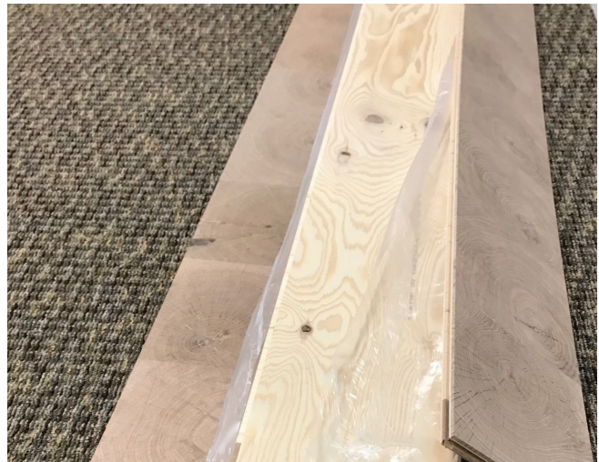
Engineered End Grain planks remain in packaging until installed

We are often questioned about the humidity being too high or too low. Humidity maintained above 60-70% at normal residential temperatures can adversely affect wood components. Humidity sustained at or above this level can result in an EMC of 12% or more with associated expansion. Humidity maintained at or below 25-30% can adversely affect wood components and result in an EMC below 6%.