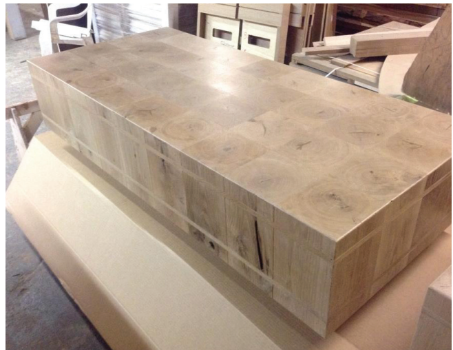
Coffee table with Engineered End Grain White Oak surface