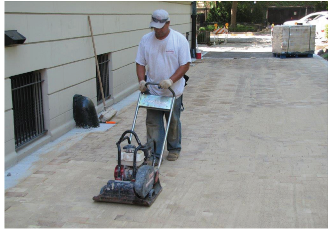
Vibrating sand joint filling (optional)

Black locust is the most rot resistant specie we offer, and does not require penetrating oils for longevity . In fact, immediately following paver placement while wet, oils will not penetrate anyway. When pavers begin to dry at the surface, you could effectively use a penetrating oil. We recommend Woca Exterior Oils , (see woca.com ) available in a multitude of colors. Penetrating oils are not coatings and so if used they must be thoroughly wiped from the surface to remove all excess. Or, re-wet the pavers with water to close the shrinkage cracks and spaces. Displacement of moisture by penetrating oils is preferred, but adding back the lost moisture is a good remedy as well.