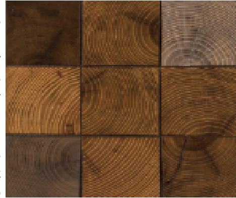
Square Pavers, machine sanded with Woca penetrating oils, in colors and in neutral

Wood is a natural product, subject to numerous variations in grain, color, hardness, and dimensional stability. Machine tolerances are measured by us during manufacturing only, with a tolerance of +/- .02". Moisture can enter and exit rapidly through the end grain. And, so, after manufacturing, the pavers can gain or lose moisture, thus changing their measurement. Our pavers, as well as other wood items, change in moisture content and dimension during and after fabrication, while awaiting shipment, in transit, and at the jobsite. For this reason, as well as others, it is important that the installer measure and record the moisture content of the pavers at time of delivery. Doing so is necessary to determine the length of acclimation time for your project. The target moisture content for our pavers is 15-20%, with a 5% allowance for pieces outside the range.