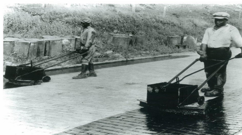
Squeegee Machine application of hot coal tar pitch on a wood block street, circa 1900

Since their installation at Wood Paver Alley black locust has become our most popular specie for exterior application. Black Locust is a medium-sized deciduous tree, extremely hard, with moderate expansion and contraction. When used out of doors black locust pavers will develop a silver gray patina, one of the special and desirable properties of black locust. Once "weathered" gray, the pavers will remain unaltered in appearance for years. Soil type and climate both influence the composition of a tree, which means that each wood block paver can be unique as well. Slight deviations in color, structure, density, and general appearance is absolutely normal. Black locust is native to the central-eastern United States, from Pennsylvania along the Appalachian Mountains, to western Arkansas, southern Missouri, and to northern Georgia and Alabama. The greatest production is actually in Tennessee, Kentucky, West Virginia, and Virginia.