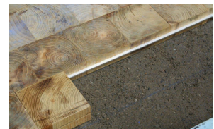
1 1/2 " depth x 4" x 4" Black Locust on gravel, with aluminum spine connection

Shapes: Squares, rectangles, and hexagons ( Mesquite paver shown on right ), with optional polished edges and corners. Patterns: Running bond or tile pattern