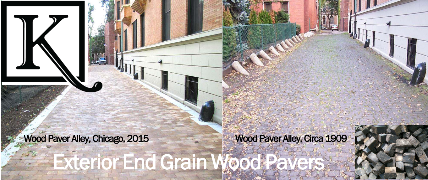
Wood Paver Alley, Chicago, 2015