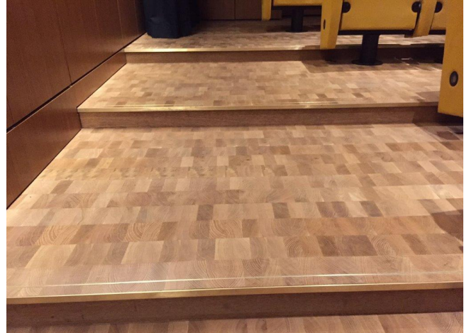
Steinway Showroom, NY City, White Oak Strip Block steps

Blocks within the strips can vary such that maintaining a perfect lap joint will be difficult, although every effort should be made to do so. DO NOT attempt to install strips so that blocks are in straight rows in two directions. Straight lines or rows in two directions cannot be created with blocks in strips. Blocks within strips appear to all be the same size, but can be a slight variation that would adversely affect your ability to maintain straight lines in two directions.