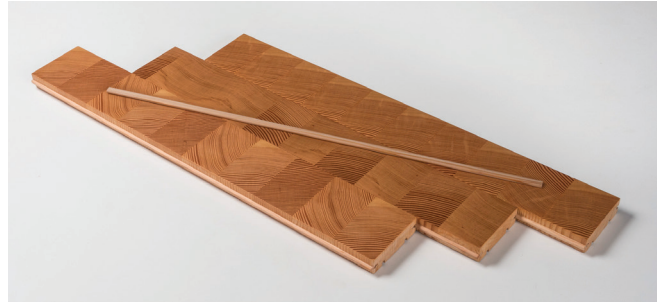
Fir Strip tongue and groove with spline (splines supplied seperately)

We suggest Bostik's MVP if a vapor barrier is needed. Allow MVP to dry and apply Bostik's Urethane Adhesive the next day. Adhesive open time up to 2½ hours, but read labels. Always use with adequate ventilation.