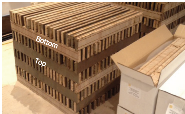
Open stacking for acclimation of prefinished strip blocks

Humidity maintained above 60-70% at normal residential temperatures can adversely affect wood components. Humidity sustained at or above this level can result in an EMC of 12% or more with associated expansion. Humidity maintained at or below 25-30% can adversely affect wood components and result in an EMC below 6%.