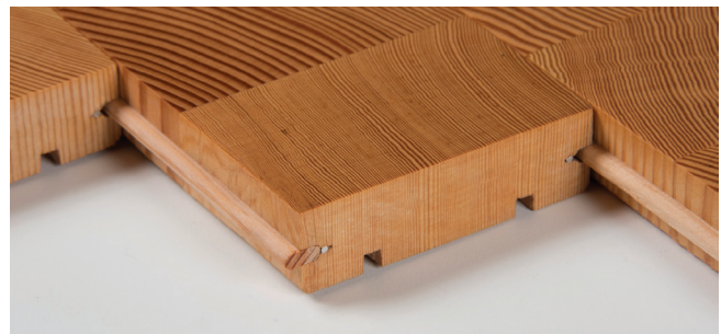
Close up of Fir Strip with tongue and groove