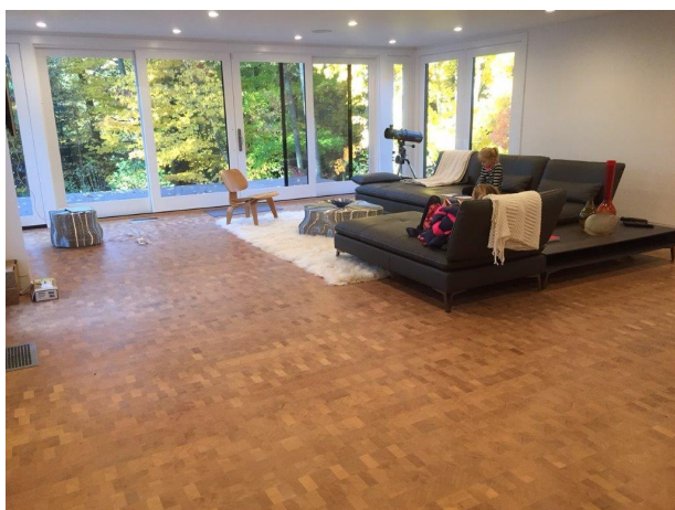
Hemlock Strip Block, with Woca Butternut , Residence