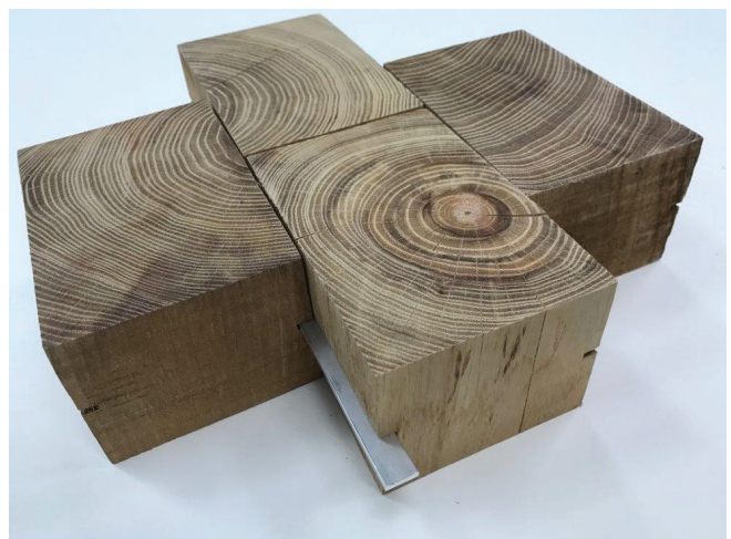
2 ½ depth x 4" x 6" rectangular Black Locust pavers with aluminum spline for tongue and groove installation.