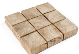
2" depth x 4" x 4" Black Locust pavers on mesh, in tile pattern, with 3/8" spaces.