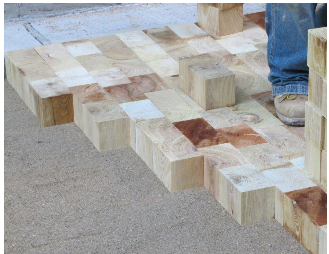
Black Locust installation over sand, no grooves, no mesh.

4.) All Black Locust areas should be framed using wood, concrete, or other material to keep pavers in place at their perimeter.