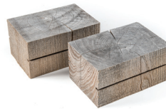
Weathered pavers with grooves.

Most of our installations are made with Black Locust. However we do offer Mesquite, Redwood and Pine for some exterior applications. Black Locust is a medium-sized deciduous tree native to the central-eastern United States. Extremely hard, and rot resistant. Black Locust will "weather" in a gray tone. Once "weathered", the pavers will remain unaltered in appearance for years.