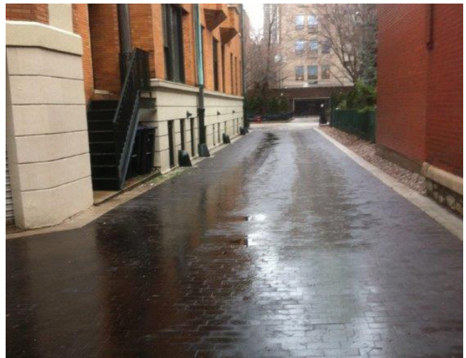
Black locust pavers street application wet from rain.