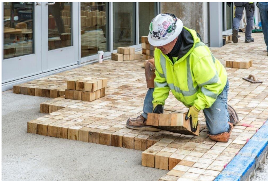
Black Locust on plastic mesh, Harvard University, Cambridge MA

Kaswell suggests an individual block paver moisture content 25% or higher for exterior installations made without spacing between pavers. Unless advised otherwise, Kaswell will not dry the stock before fabrication into individual blocks for exterior installation. For drier locations, pavers could be ordered at 15% or less. For any unique environment such as dry desert areas, unusually high humidity or tropical climates, we suggest consulting with us to better determine the suitability of the product, a recommended moisture content for manufacturing, and best methods for installation.