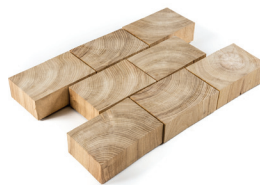
2" depth x 4" x 6" Black Locust pavers on mesh, in running bond pattern, no spaces