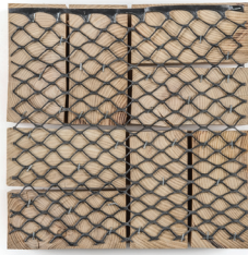
Pavers on plastic mesh panels.

3.) Panelized pavers on plastic or on metal mesh. Panel size approximately 2' x 3', with or without spaces between pavers. They can be ordered with uniform spacing up to ½" in width (ADA compliant)