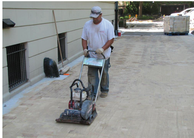
Vibrating sand joint filling (optional)

Black locust is the most rot resistant specie we offer, and does not require penetrating oils for longevity . In fact, immediately following paver placement while wet, oils will not penetrate anyway. When pavers begin to dry at the surface, you could effectively use a penetrating oil. We recommend Woca Exterior Oils , (see woca.com ) available in a multitude of colors. Penetrating oils are not coatings and so if used they must be thoroughly wiped from the surface to remove all excess. Or, re-wet the pavers with water to close the shrinkage cracks and spaces. Displacement of moisture by penetrating oils is preferred, but adding back the lost moisture is a good remedy as well.