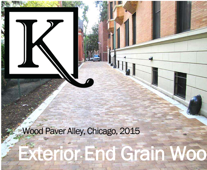
Wood Paver Alley, Chicago, 2015