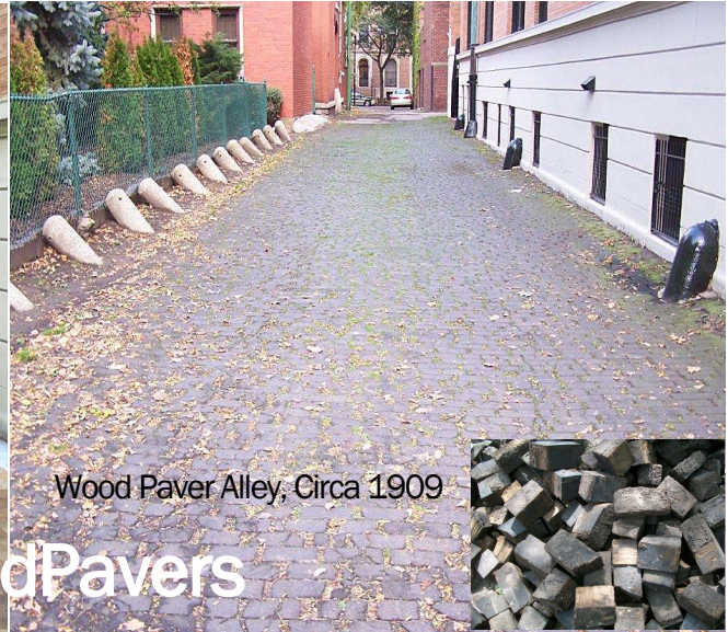
Wood Paver Alley, Circa 1909