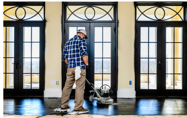
Removing excess UnoCoat® with a standard buffer and white pad.

Buff with 3M white pad until floor appears dry. Once that is completed, add a clean white terrycloth under the white pad. Begin buffing/polishing your section one last time. Double check that no excess UnoCoat® remains on your section prior to moving on.