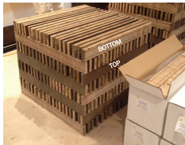
Acclimation of strip blocks