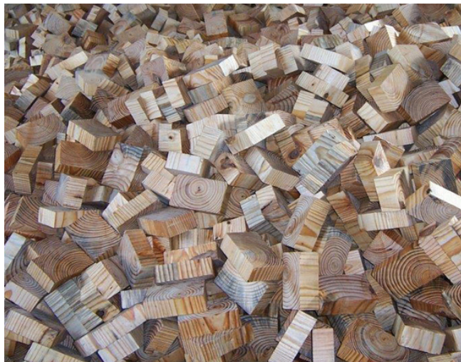
Acclimation of individual blocks

If you know the Equilibrium Moisture Content (EMC) of wood in your region, the wood brought to a jobsite might already be at or near the proper moisture content, and acclimation for any length of time may not be necessary. The installer should have a clear understanding of the EMC in order to determine the length of acclimation. This requires knowing and recording the moisture content of the wood at time of delivery, and what the expected moisture content will be at equilibrium.