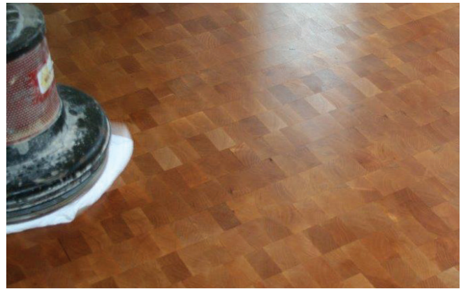
Buffing Woca Oil

DO NOT ALLOW WATER OR WATER SOLUBLE PRODUCTS OVER AN OIL FINISHED FLOOR.