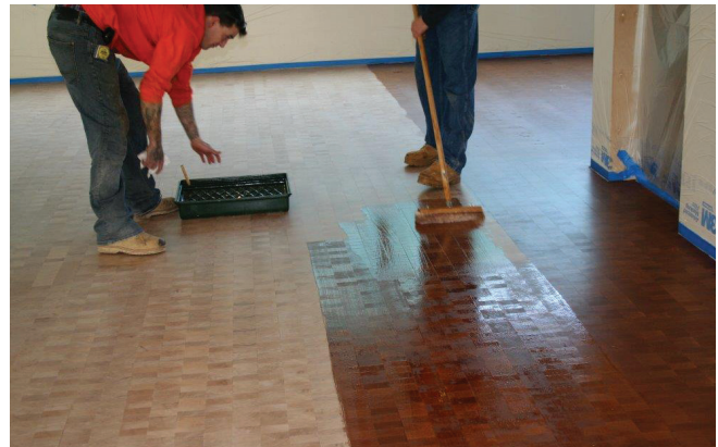
Applying Woca Oil using lambswool applicator