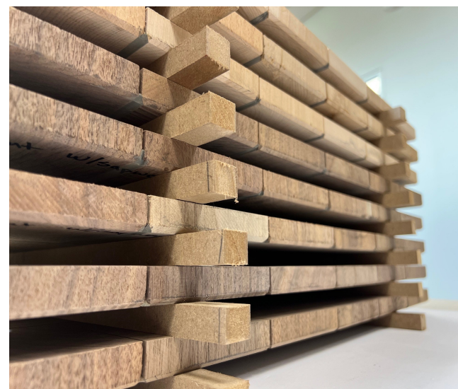
Acclimation of panel blocks