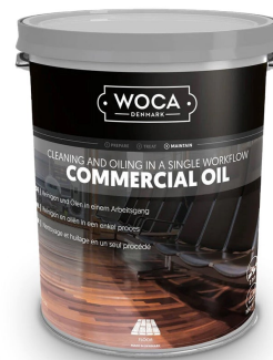
Woca Commercial Oil Cleaner