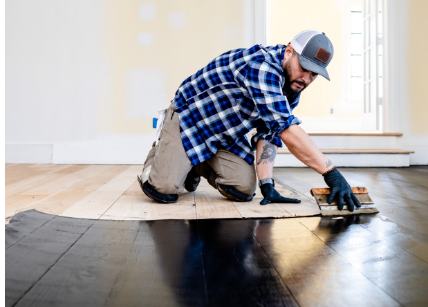
Applying UnoCoat® using the trowel method.

Note: Refrain from using all-purpose cleaners, waxes, vinegar, or polishes. These will degrade finishes over time. Please write to kaswellflooringsystems@gmail.com .