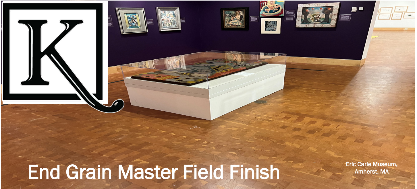
Eric Carle Museum, Amherst, MA